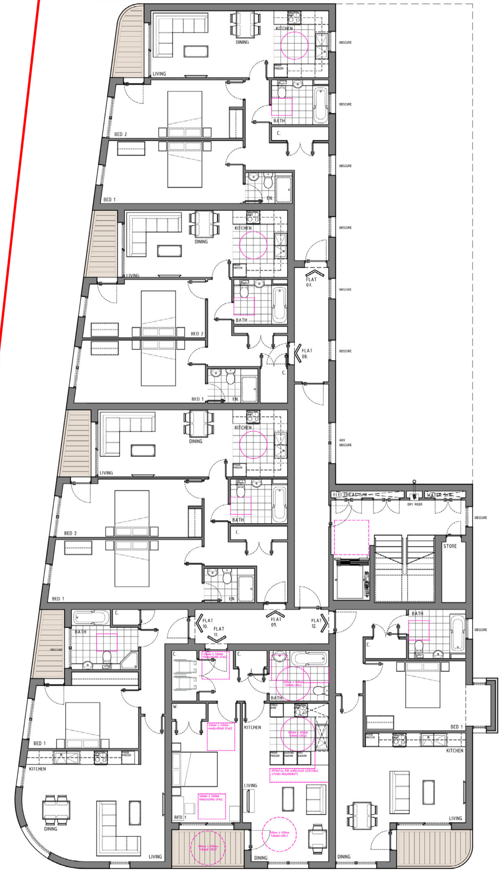
AS PROPOSED: SECOND FLOOR PLAN