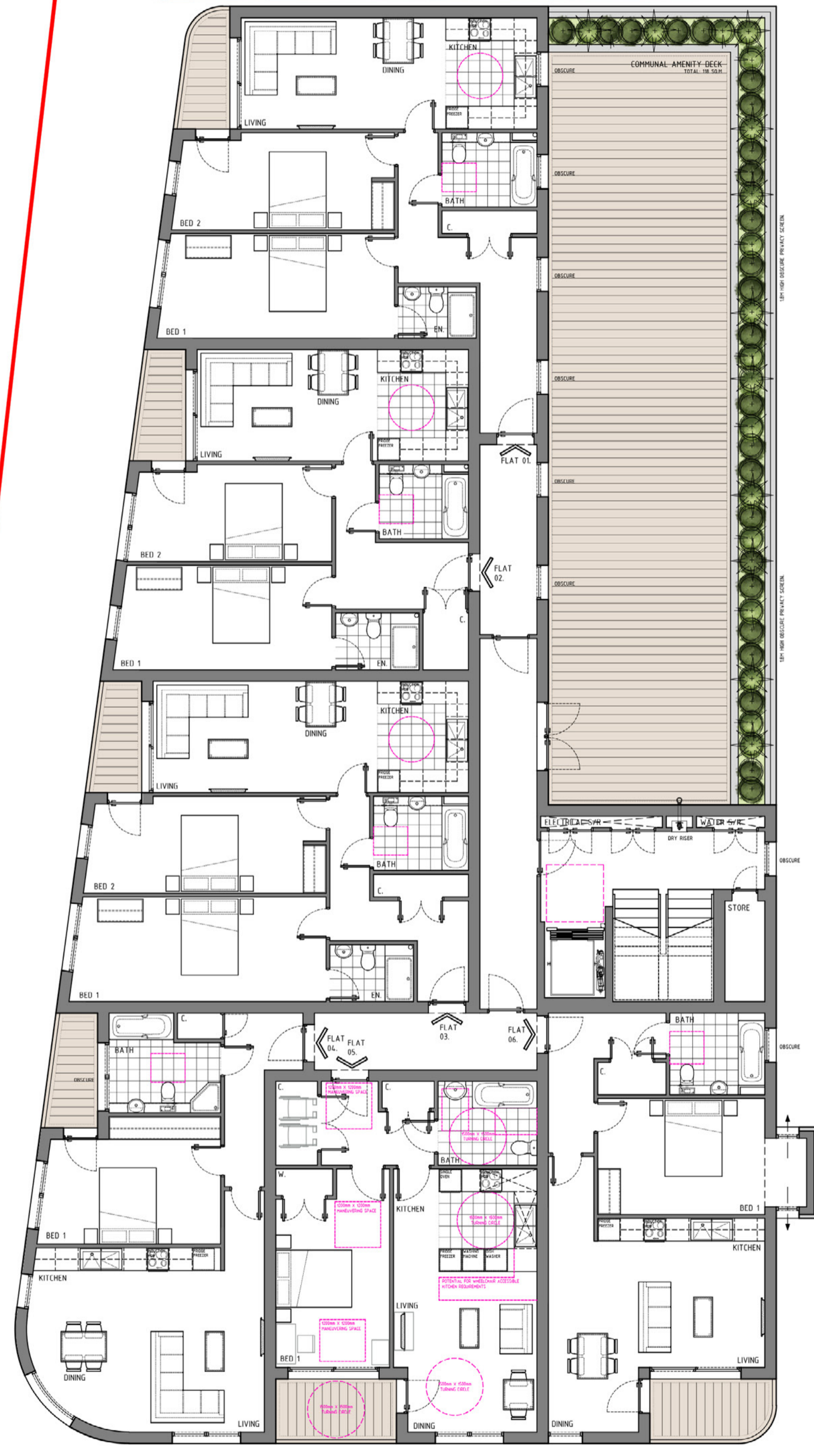
AS PROPOSED: FIRST FLOOR PLAN

GENERAL NOTES The copyright in all designs, drawings, schedules, specifications and any other documentation prepared by DAP Architecture Ltd. in relation to this project shall remain the property of DAP Architecture Ltd. and must not be reissued, loaned or copied without prior written consent. Do not scale from this drawing, use figured dimensions only. Prefer larger scale drawings. All dimensions are in millimeters (mm) unless otherwise noted. Check all relevant dimensions, lines and levels on site before proceeding with the work. This drawing is to be read in conjunction with all Architect's drawings, schedules and specifications, and all relevant consultants' and/or specialists' information relating to the project. Refer all discrepancies to DAP Architecture Ltd.